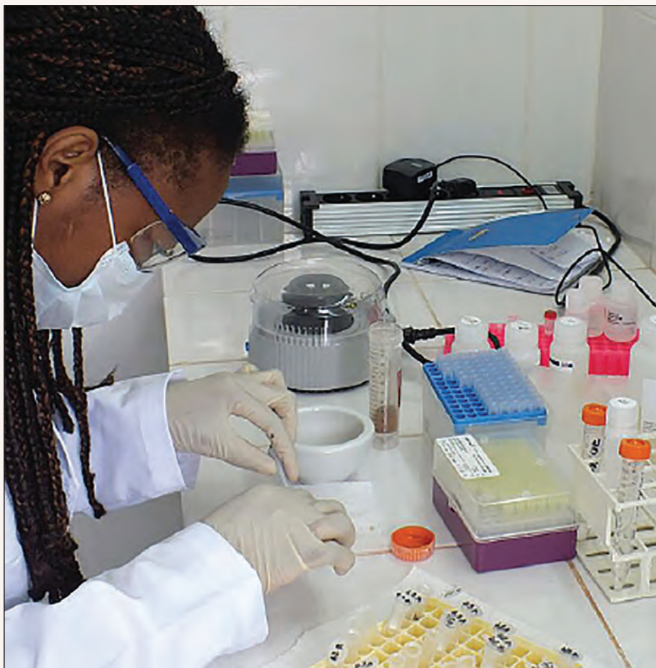
Malaysia's National Wildlife Forensic Laboratory developing Tiger identification techniques.