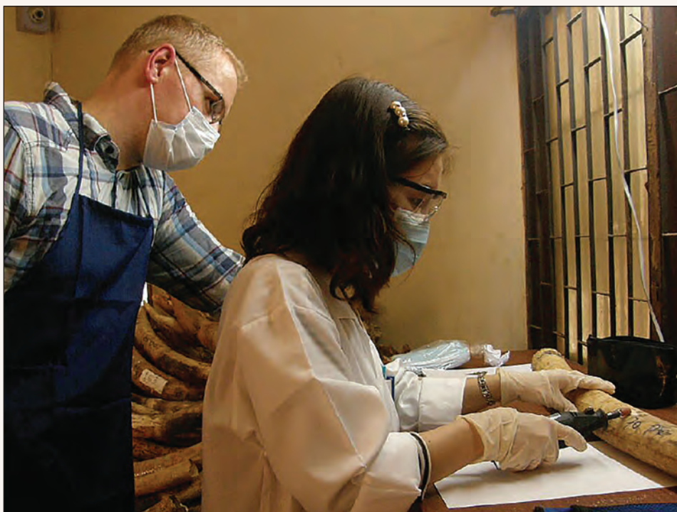
Collaborating on ivory DNA identification in Thailand.

The aim is to provide information to direct enforcement investigations or inform policy in relation to illegal trade of wildlife.