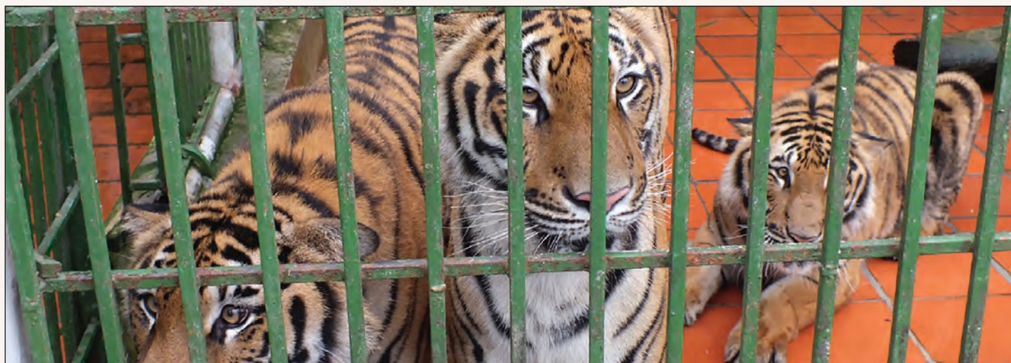
Advances in DNA profiling technology allows for DNA registration schemes to be tested for captive Tigers.