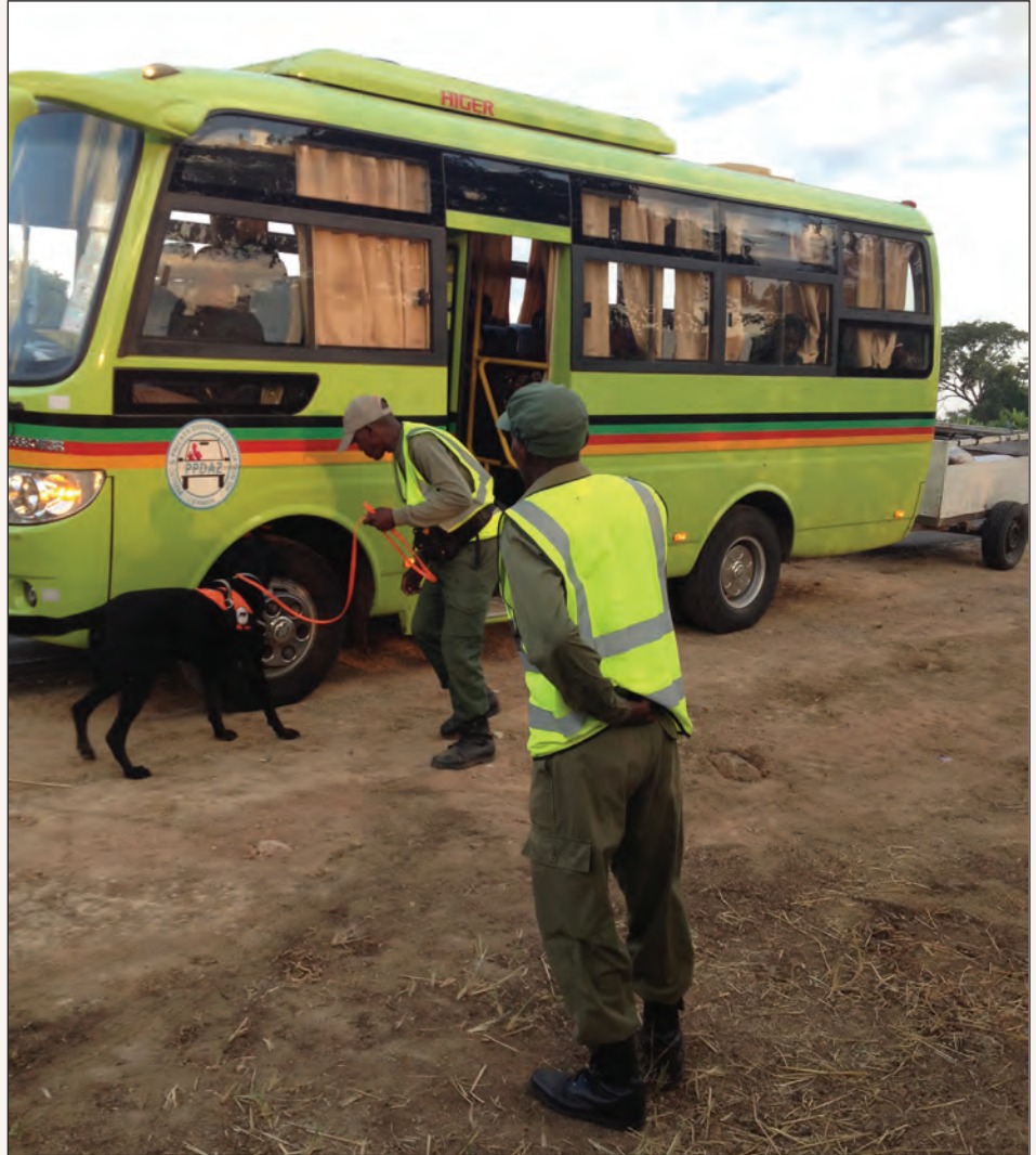
Conservation K9 Ruger searches a vehicle at a roadblock in Zambia. Adopted from a Montana (USA) shelter, he completed his training in late 2014 and has since alerted to the presence of many items that people were attempting to conceal. Ruger is blind.

In Asia, we help canine custom teams considerably refine their ability to detect the transport of