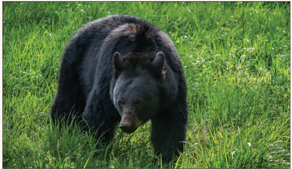
American black bear ( Ursus americanus )

Following the attack, NPS officials captured three bears who independently entered the vicinity of the attack site. Each bear was