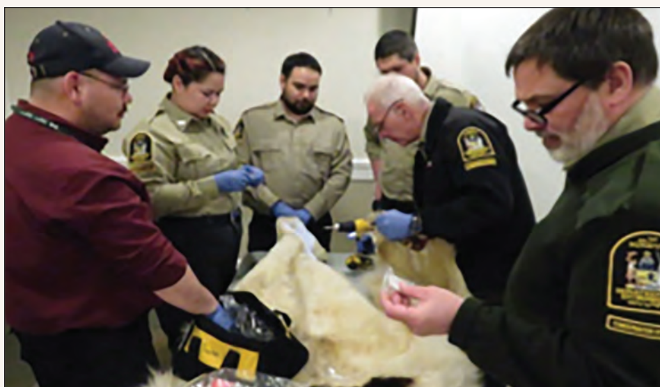
Training of Nunavut Government conservation officers on the 3-Pronged Approach, in Iqaluit, Nunavut.

The Stable Isotope analysis, led by Dr. Geoff Koehler, stable isotope chemist at ECCC's National Hydrology Research Centre (NHRC) lab in Saskatoon, Saskatchewan, which will complement the DNA analysis and PIT tagging, utilizes stable isotope ratios ( ^{13}\text{C}/^{12}\text{C} , ^{15}\text{N}/^{14}\text{N} , ^{34}\text{S}/^{32}\text{S} and 2\text{H}/\text{H} ) that are specific to given geographical locations and can aid in determining the geographical source of the polar bear. This strategy is based on the fact that all living organisms possess stable isotopic signatures that reflect the trophic position and geographical location in which a particular species resides. Incorporation of trace elements from the environment can be used once elemental profiles have been established. The SIA and DNA methods require creating databases for isotopic/elemental maps and genetic markers, respectively.